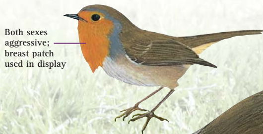
Both sexes aggressive; breast patch used in display