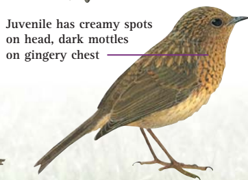
Juvenile has creamy spots on head, dark mottles on gingerly chest