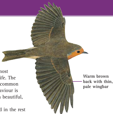
Warm brown back with thin, pale wingbar

Actually a native of deciduous woodland in the rest of Europe, the profusion of trees, hedges and lawns so typical of parks and gardens in Britain suit it perfectly. Very territorial, the Robin defends its own 'patch' aggressively. Rivals puff their red breasts up and hurl bursts of song at each other, and serious fights can occur. Robins keep a territory throughout the year as