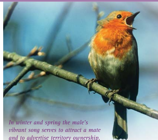
In winter and spring the male's vibrant song serves to attract a mate and to advertise territory ownership.

pairs need an exclusive place to breed and provide a reliable source of food.